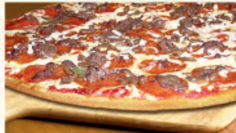
Ultra Thin Crispy Crust

Garden Pizza Ranch sauce, broccoli, cauliflower, onions, fresh tomatoes, cheddar, mozzarella & provolone cheese