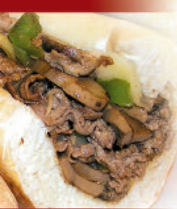
Philly Cheese Steak