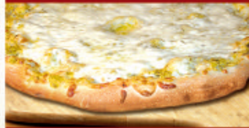
Medium Crust - Famous White Pizza