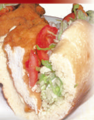
Breaded Chicken Breast