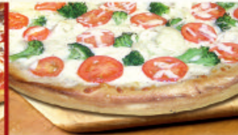
Pan Style - Garden Pizza