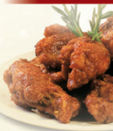
Jumbo Chicken Wings