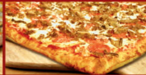
Sicilian - Thick Crust Square